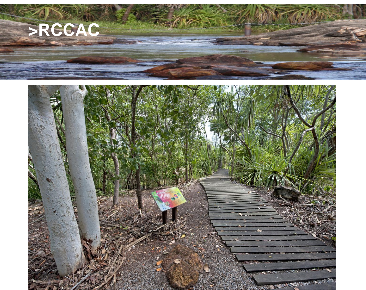
Figure 1: Gurambai